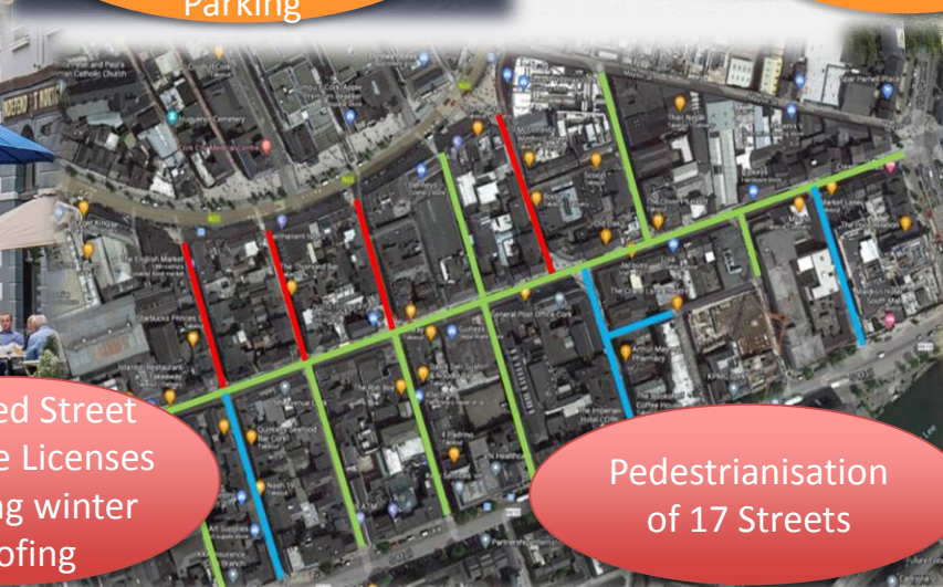
Pedestrianisation of 17 Streets