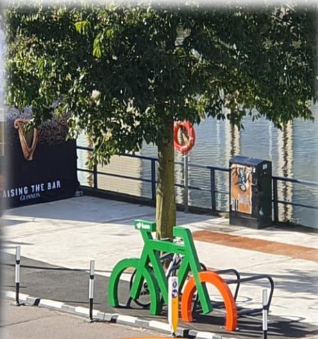
Addition of Permanent Cycle Lanes and Bike Parking