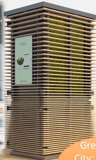
Greening the City: Air Quality Moss Walls and Planters