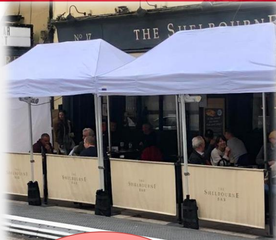
Modular Paving Facilitating Outdoor Dining