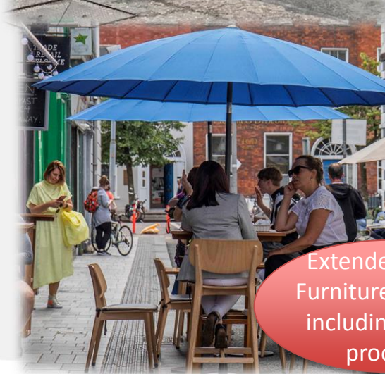
Extended Street Furniture Licenses including winter proofing