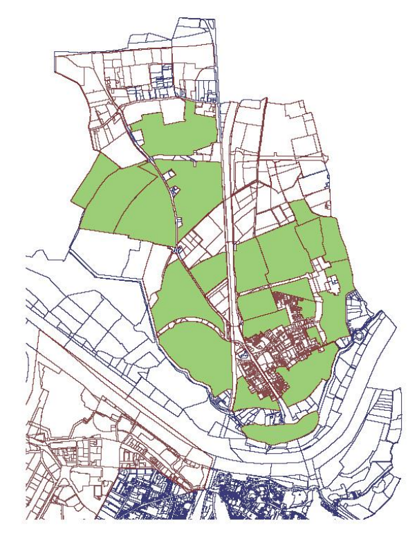
Land to be developed by the land servicing company